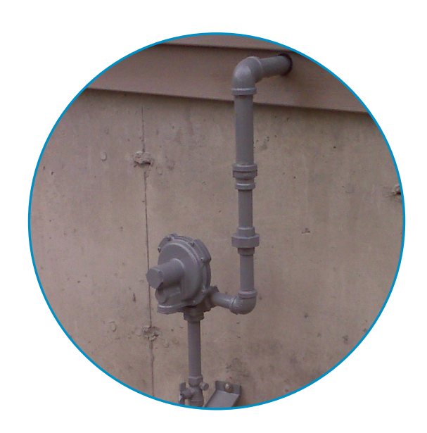
Example of a secondary pressure regulator

If you are not familiar with your propane system, take a few minutes to review it. Identify core components—tank, regulators, meter, piping, and supply valves—as well as any appliance vents. Be sure you know where your gas supply valve is located, in case you need to close it in the event of an emergency. For more information, contact your propane retailer.